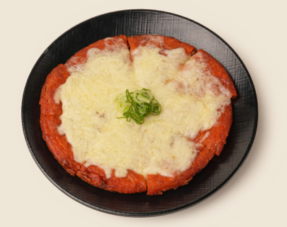
CHEESE KIMCHI JEON 2 £13 Korean savory pancake made with Kimchi topped with mozzarella cheese