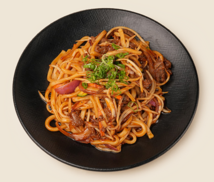
BEEF NOODLE £13.5