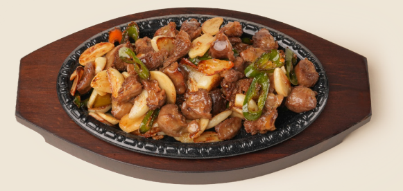
CHICKEN GIZZARD \bigcirc £13.5 Stir-fried chicken gizzard with garlic and chilli

Stir-fried spicy pork with mozzarella cheese on a hot plate