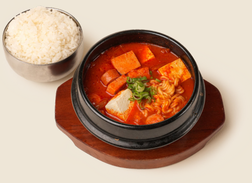
BUDAE JJIGAE 🥥 £14.5 Spicy sausage stew with Kimchi and ramyun noodle

DOENJANG JJIGAE £13.5 Korean stew made with fermented soybean paste