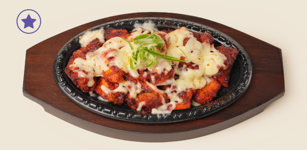
CHEESE & SPICY CHICKEN (2) £15.5 Stir-fried spicy chicken with mozzarella cheese on a hot plate