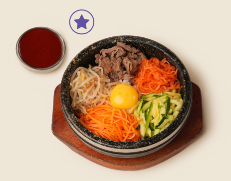
BEEF BIBIMBAP £13.5 A rice bowl topped with a variety of seasoned sautéed vegetables and marinated beef

DOLSOT BIBIMBAP is a Korean dish served in a stone pot. The residual heat from the pot cooks the rice at the bottom until it becomes crispy, with a distinctive sizzling sound. It includes mixed rice, sautéed seasoned vegetables, raw egg yolk, and red chili paste with sesame oil.