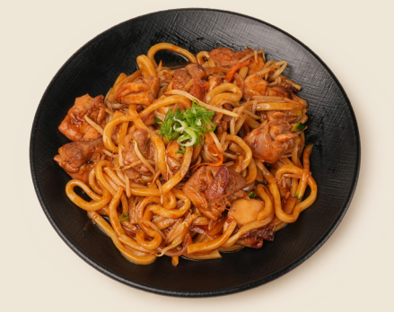
CHICKEN NOODLE £13.5