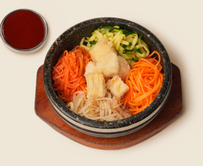
TOFU BIBIMBAP v £13 A rice bowl topped with assorted seasoned sautéed vegetables and deep fried tofu