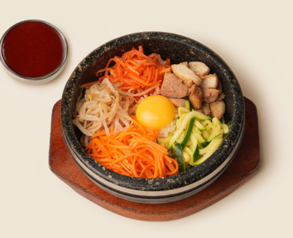
CHICKEN BIBIMBAP £13.5 A rice bowl topped with assorted seasoned sautéed vegetables and marinated chicken