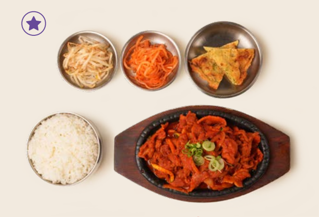
SPICY PORK 🥖 £12 Sliced pork marinated in spicy sauce with mixed vegetables