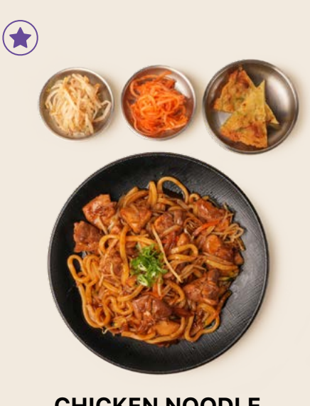
CHICKEN NOODLE £11.5