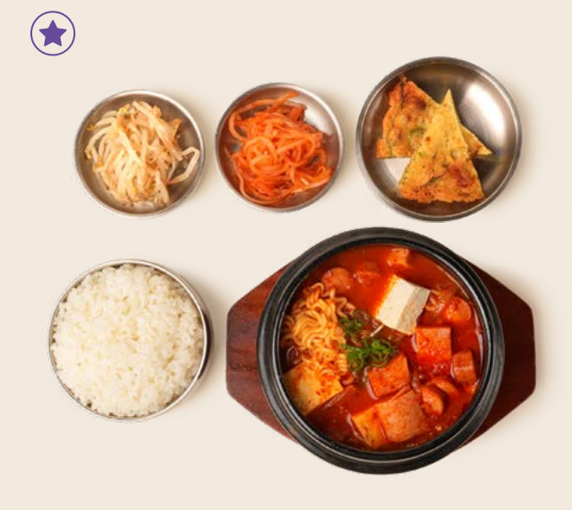
BUDAE JJIGAE 9 £12 Spicy sausage stew with kimchi and ramyun noodles