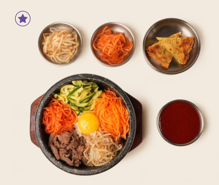
BEEF BIBIMBAP £12

A rice bowl topped with a variety of seasoned sautéed vegetables and marinated beef