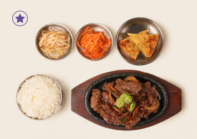
BULGOGI £11.5 Marinated thinly sliced beef with mixed vegetables