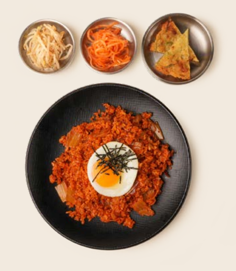
KIMCHI FRIED RICE £11.5 Stir-fried Kimchi and rice topped with a fried egg

1 Kimchi fried rice + 3 Korean side dishes